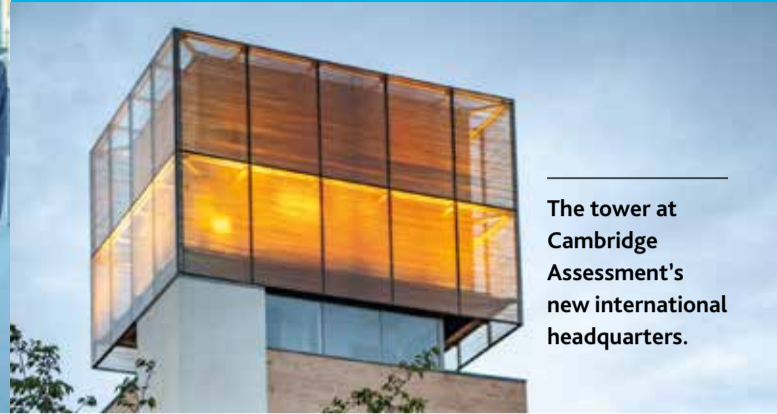
The tower at Cambridge Assessment's new international headquarters.