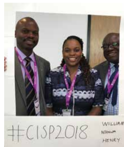
Delegates enjoyed the 'selfie' photo booth on this year's Cambridge International Study Programme.