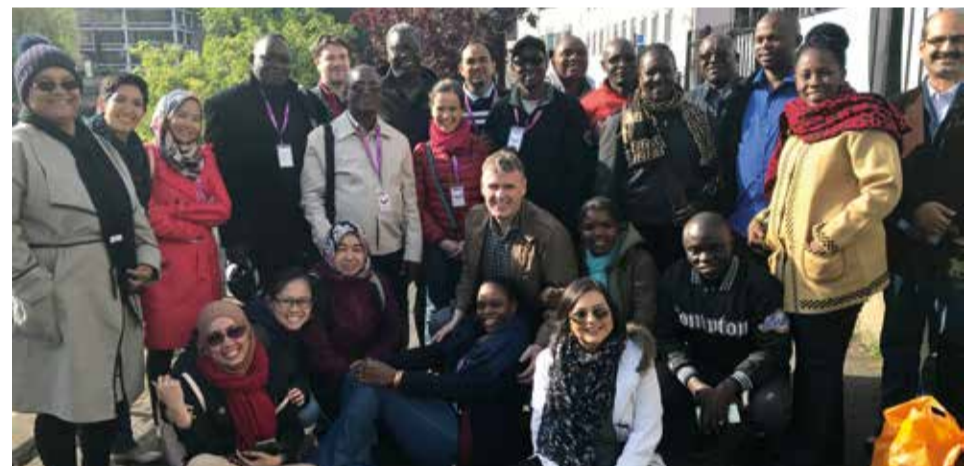
Delegates braved the early spring chill to go punting on the River Cam.