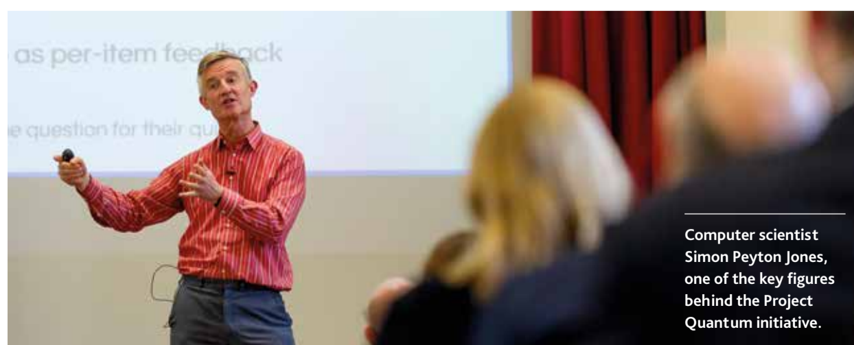
Computer scientist Simon Peyton Jones, one of the key figures behind the Project Quantum initiative.